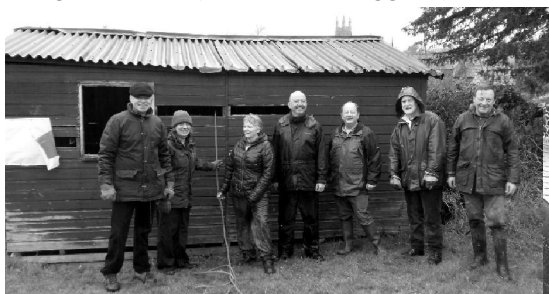
Shed demolition team...